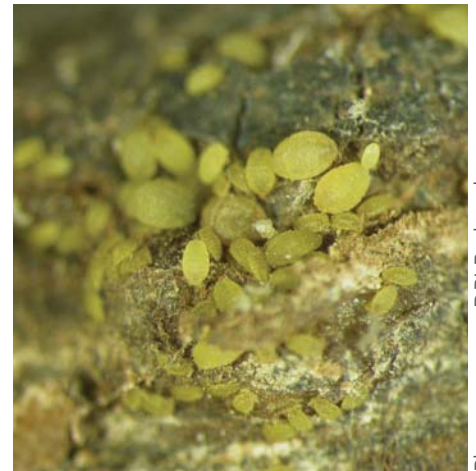
Grape phylloxera insects

As a result of a detection of phylloxera in 2006, DPI established the Maroondah phylloxera infestation zone (PIZ) to restrict